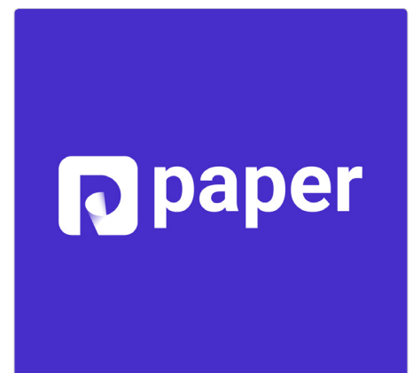
Paper by Logorilla