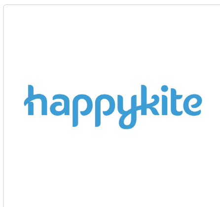
Happykite by Dalius Stuoka