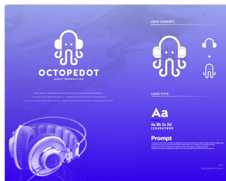
Octopedot by Garagephic Studio