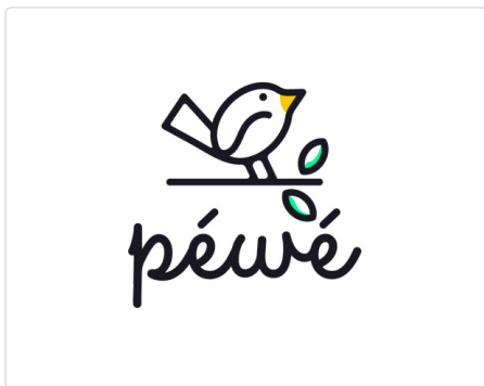
Péwé Coffee by Logorilla